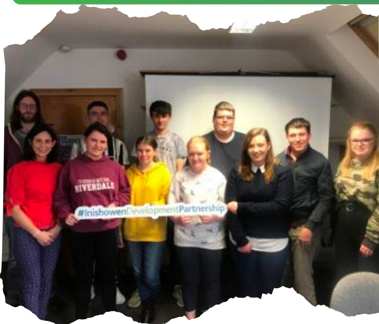
The Chance Participants who successfully completed their ECDL Course recently in Buncrana.

Participants on our Communications module L4 in Serenity House, Moville. This hands on communications course focuses on all the critical elements, allowing you to leave the course with a plan to build your self confidence and improve your communication techniques. The course is offered on a part-time basis – a total of 42 hours. The programme duration is 7 full days (1 day a week).