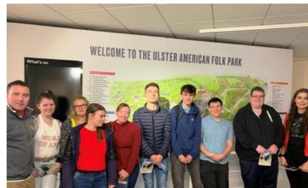
Education and Social Outing The CHANCE Project visiting the Ulster American Folk park in Omagh.